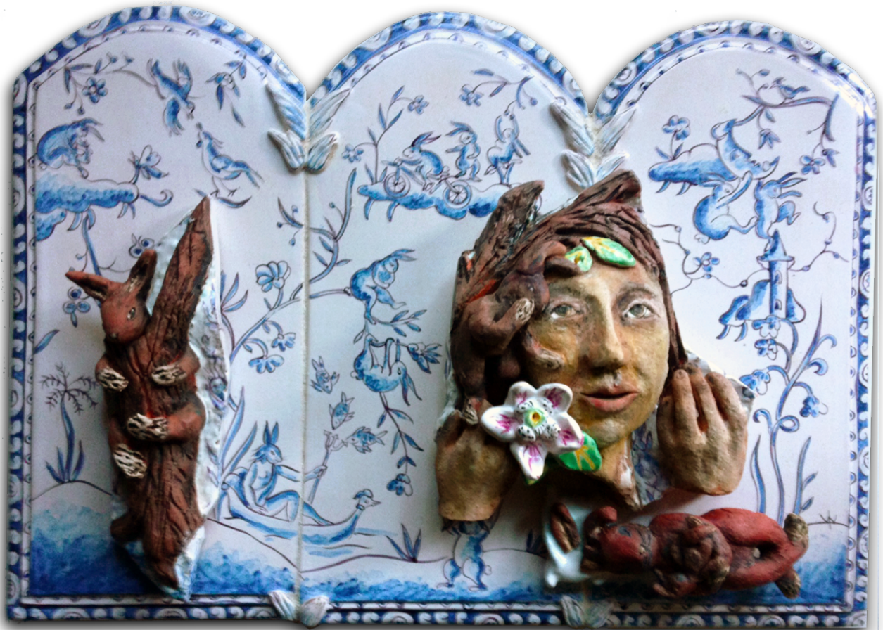
"LAPINOLOGY" by Irène de Watteville