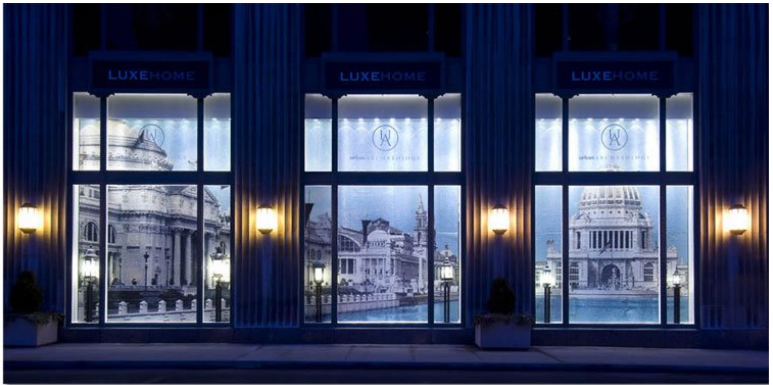
The "White City" in reflection. A mosaic depiction of the buildings at the World's Columbian Exposition in Chicago in 1893. Mosaic by Bisazza in 12' x 12" modules, commissioned by Urban Archaeology for the south-facing, exterior windows of its showroom at the Merchandise Mart in Chicago, 2007. Special thanks to Judith Stockman.