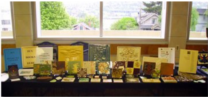
The Tile Heritage table at the NW Handmade Tile Festival. All tiles are donated to the Foundation for this fund-raising event.

All entries in the juried show were impressive and indicated the extent of talent the greater Northwest is harboring.